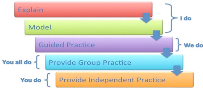
Figure 1. Gradual release model of teaching

background knowledge. Skills that are taught later in the year include inference making and comprehension monitoring and repair. This developmental approach is based on early research (Blank, Rose, & Berlin, 1978) that indicated that language develops from literal to inferential. Comprehension questioning can also be organized in this way so that easier types of comprehension skills are taught and mastered before inferential questions. In reality, it is likely that successful comprehension requires many strategies working in concert and that the development of these strategies is not linear. The goal of teaching the strategies in this particular order is to allow children to begin to develop more basic competencies, before moving on to more difficult and abstract strategies. When planning comprehension instruction, teachers should think about comprehension instruction as being cumulative; that is, new strategies build on and extend previous ones. It is likely that all students, even those who are not struggling readers, benefit from this type of explicit and systematic comprehension instruction. Therefore, we suggest that comprehension strategies be introduced in whole-class settings, with extended practice and direct instruction provided in small groups for students who are in need of supplemental Tier 2 instruction.